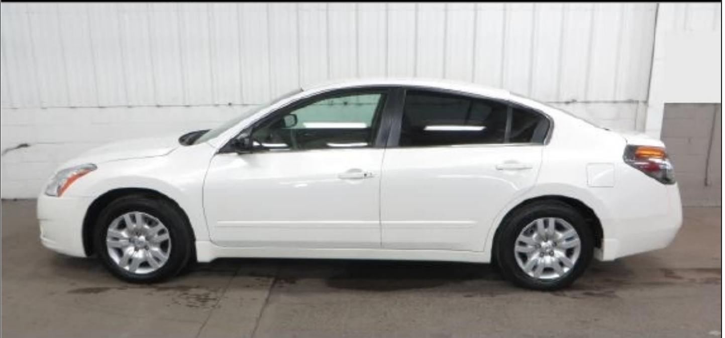
2012 Nissan Altima