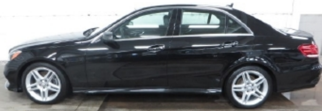
2014 Mercedes-Benz E350 4Matic