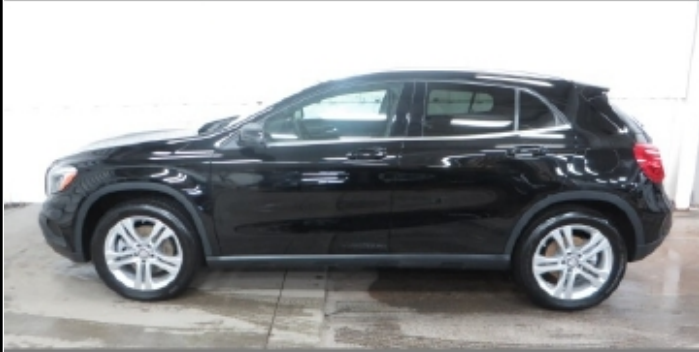
2015 Mercedes-Benz GLA250 4Matic Call For More Information 716-633-0088